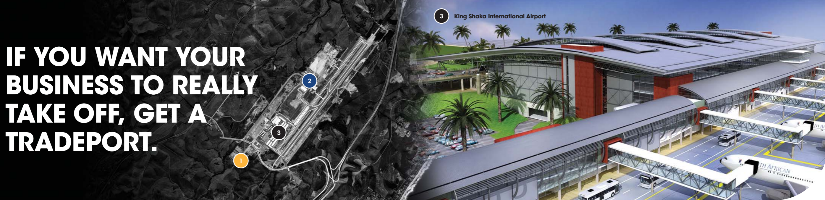
3 King Shaka International Airport

IF YOU WANT YOUR BUSINESS TO REALLY TAKE OFF, GET A TRADEPORT.